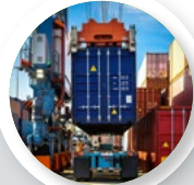
Dedicated capacity for customers and partners