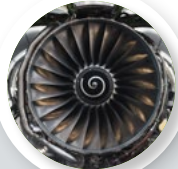
Control & monitoring of essential assets